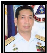
VADM Ramon C Liwag Republic of the Philippines