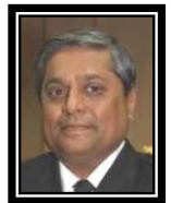
VADM Anil Chopra Republic of India