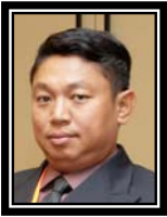
CAPT Moe Aung Union of Myanmar