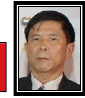
Snr Capt Hoang The Su Socialist Republic of Viet Nam