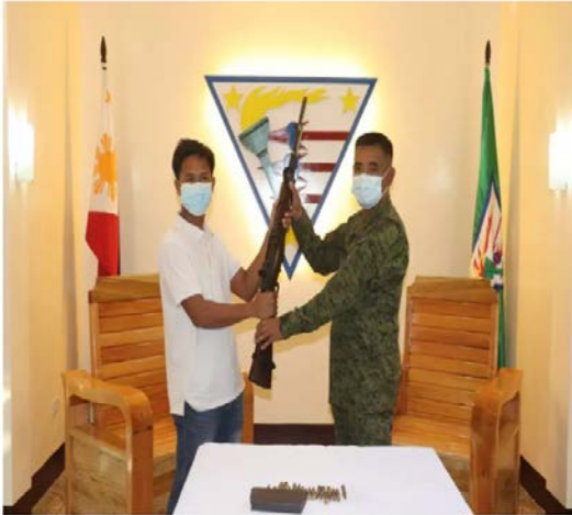
Abu Sayyaf Group member surrendered to the military in Basilan in April 25, 2021.