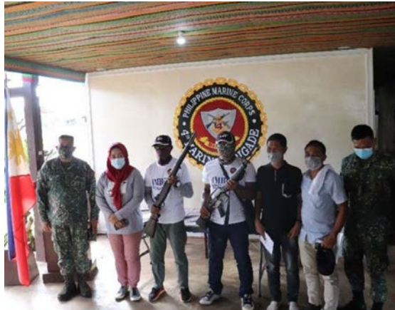
ZAMBONGA. Two supporters of Abu Sayyaf bandits surrender to government authorities Friday, May 7, in the town of Onar, Sulu. A photo handout shows the two surrenderers (holding rifles) joining military and local government officials in a postally photo after their surrender.

ASG Sub-leaders & members surrendered to government & returned to fold of the law.