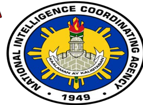
NATIONAL INTELLIGENCE COORDINATING AGENCY