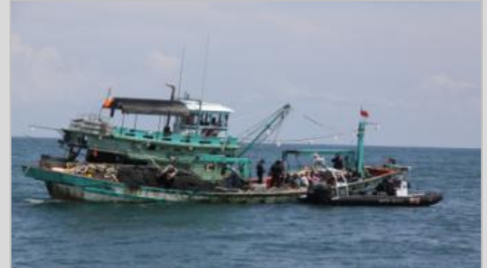
Assistance in Other Field