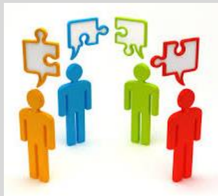
Info Sharing & Joint Investigation