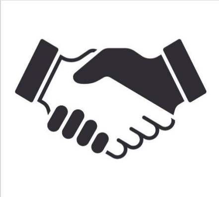
Bilateral/ Trilateral Training