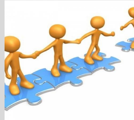
Secondment or Liaison Officer in Neighboring Country