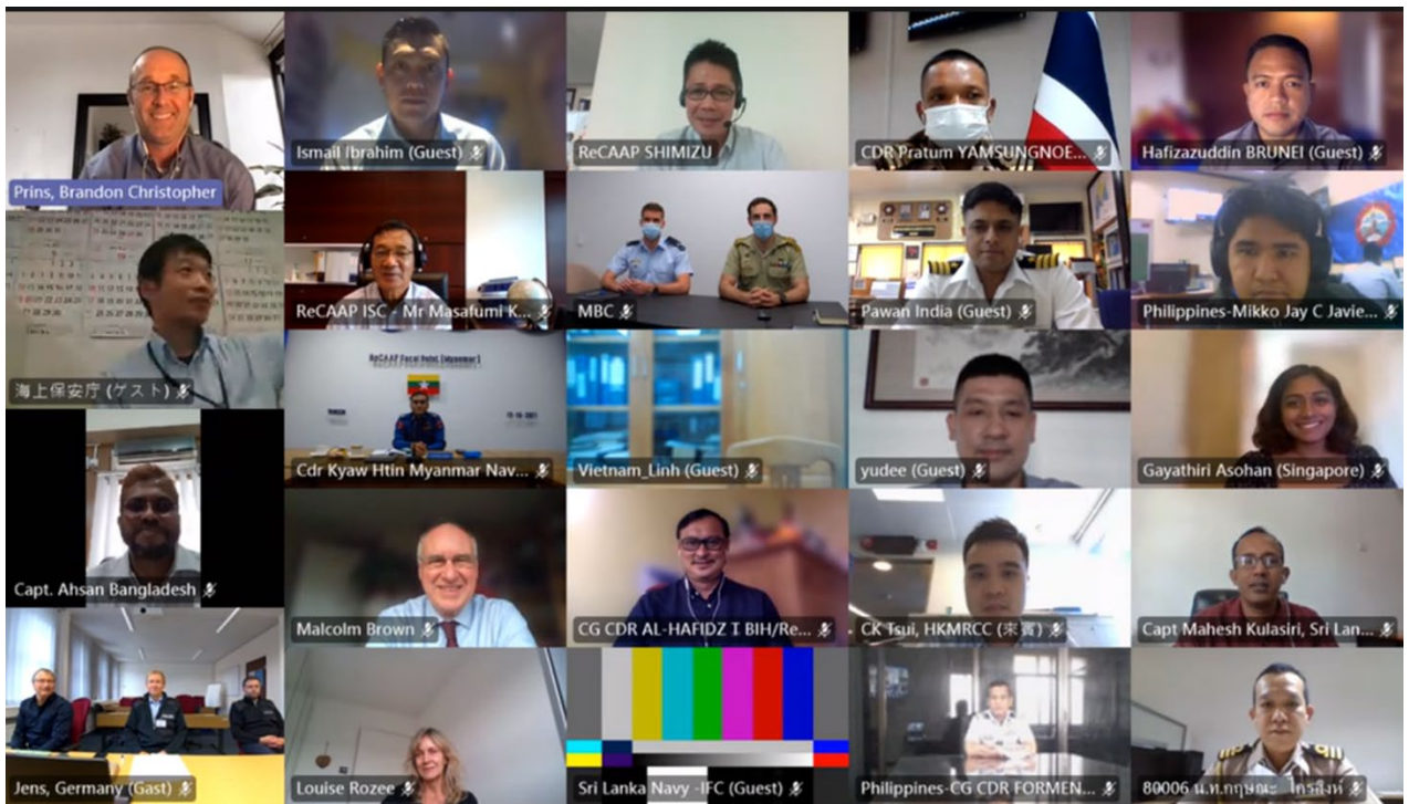
Caption: Officers from ReCAAP contracting Parties and ReCAAP ISC gathered virtually at the virtual lecture.