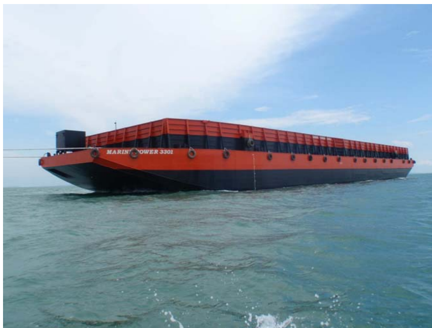
Barge Marine Power 3301