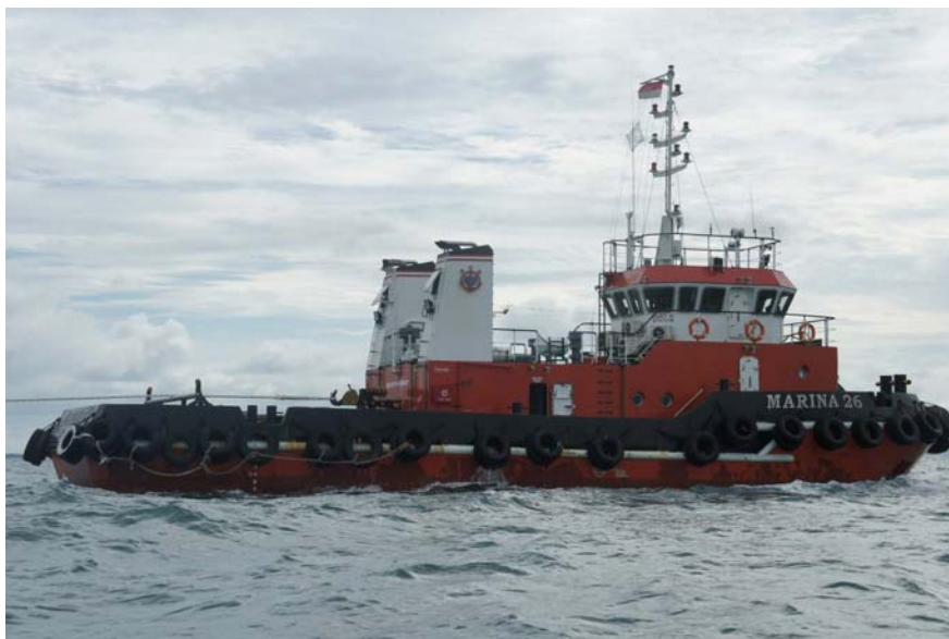
Tug boat Marina 26

The ReCAAP ISC encourages all ships to look out for tugboat Marina 26 and barge Marine Power 3301 and report sightings to Singapore's POCC, or the nearest MRCC. Please refer to pictures of the vessels below.