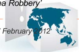
Poster on 'Guidelines for Tug Boats and Barges against Piracy and Sea Robbery'