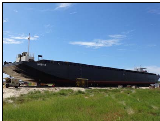
Tug boat, Manyplus 12 (left) and barge, Hub 18 (right)