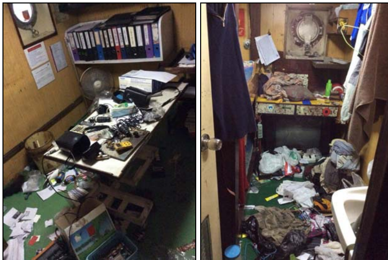
Cabins ransacked by perpetrators

5. The Royal Thai Navy (RTN) which is the ReCAAP Focal Point (Thailand) informed the ReCAAP ISC that on 15 Feb 15 at or about 1420 hrs (local time), the Thai authorities boarded Lapin at location north of Ko Tarutao and rendered assistance to the crew. The Focal Point also mentioned that a Thai Explosive Ordnance Disposal (EOD) team managed to disarm the “improvised’ explosive package and found only an electric circuit with no explosive or detonator attached.