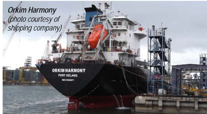
Orkim Harmony

1. On 12 Jun 15, the ReCAAP ISC promulgated an Incident Alert about the loss of communication of a Malaysia-registered oil product tanker, Orkim Harmony . The company had last received Orkim Harmony's hourly position update on 11 Jun 15 at or about 2054 hrs (local time). Subsequent attempts to contact the vessel on all available communications were not successful.