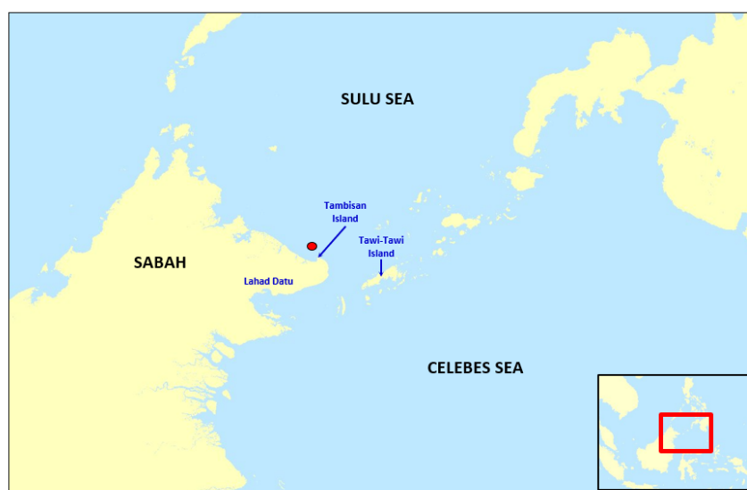
Location of the incident

The Philippine Coast Guard District Southwestern Mindanao has intensified their seaborne and coastal security patrol in coordination with Philippine and Malaysian authorities.