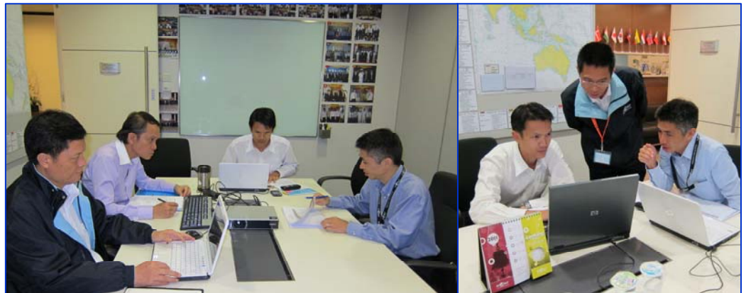
ReCAAP ISC Information Sharing Exercises led by the Programmes Department