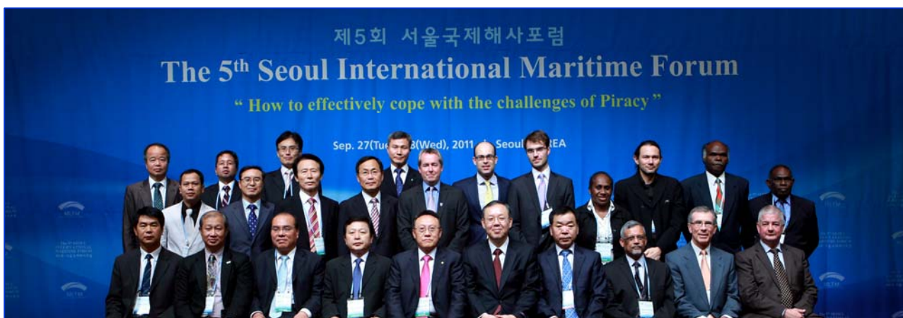
Speakers and Moderators of the Fifth Seoul International Maritime Forum, Seoul, Republic of Korea

There was an excellent mix of participants, which included international organisations / governmental agencies— IMO, UNODC, ReCAAP ISC and EUN-AVFOR; research institution and legal professionals (covering the legal aspects of the programme); and maritime industry representatives from INTER-TANKO, local shipbuilding companies, commercial entities and the IMB.