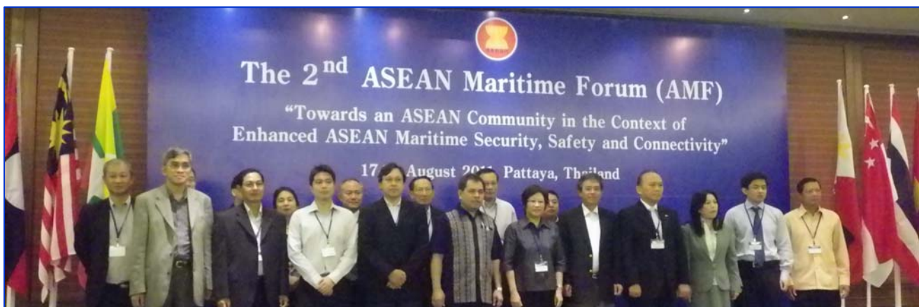
Representatives from the ten ASEAN Members, IMO, ReCAAP ISC, MSTF-IFC, UNODC and SEAFDEC

Recognising that piracy, transnational crimes and terrorism being cross-boundary, the importance to exchange information and to enhance regional maritime domain awareness were reiterated at the Forum.