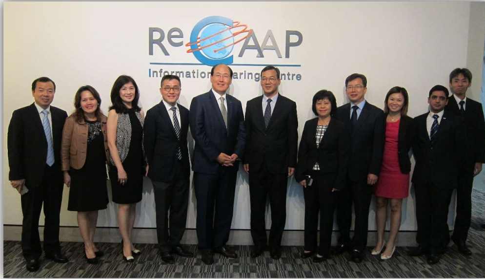
Group photo of Meeting Attendees from IMO, ReCAAP ISC, and MPA