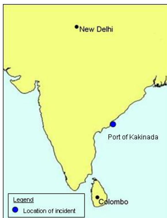
Approximate location of incident

3.1.2 The robbers worn plain shirts and pants and appeared to be local fishermen. They managed to cut about 15 m of the mooring rope. The crew, on sighting the robbers, sounded the ship's horn and activated the emergency alarm. On hearing the alarm, the robbers fled with a fire wire but left behind the 15 m mooring rope on board the tanker. The robbers jumped into their motor wooden boat which had two other robbers waiting on board. There was no damage to the tanker, and the crew did not sustain any injury.