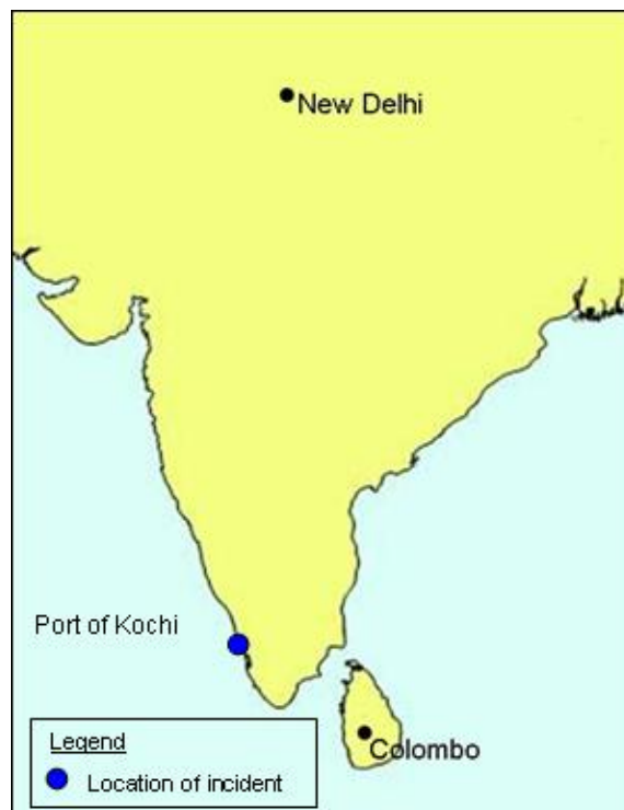
Approximate location of incident

3.2.3 The ship master reported the incident to the Port Authority of Kochi who informed the Indian Coast Guard (ICG). The ICG and the local police are investigating the incident.