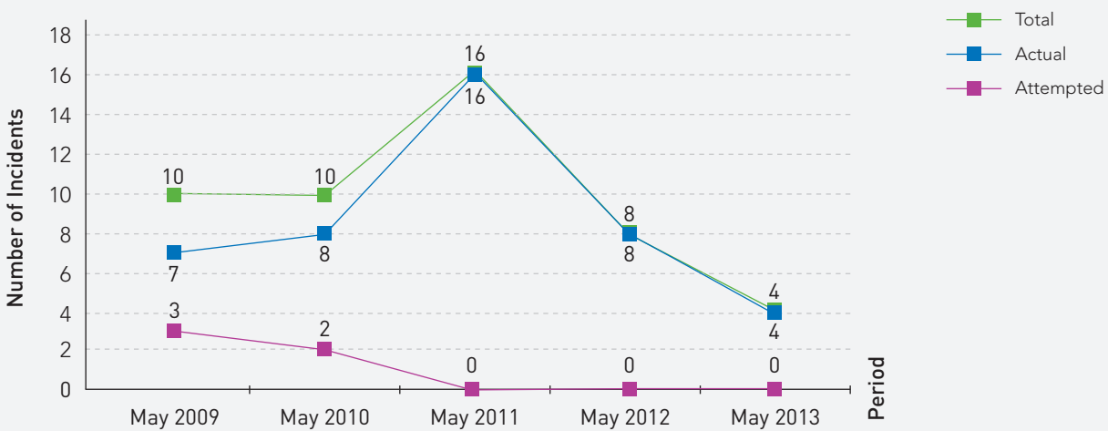
Graph 1 – Number of incidents (May of 2009-2013)

Of the four actual incidents reported in May 2013, three were Category 3 (less significant) incidents and one was a petty theft (minimum significant) incident. Notably, for the first time in May of 2009-2013, no Category 2 incident was reported. However, the number of Category 3 incidents had increased in May 2013 compared to the same period of 2009-2012.