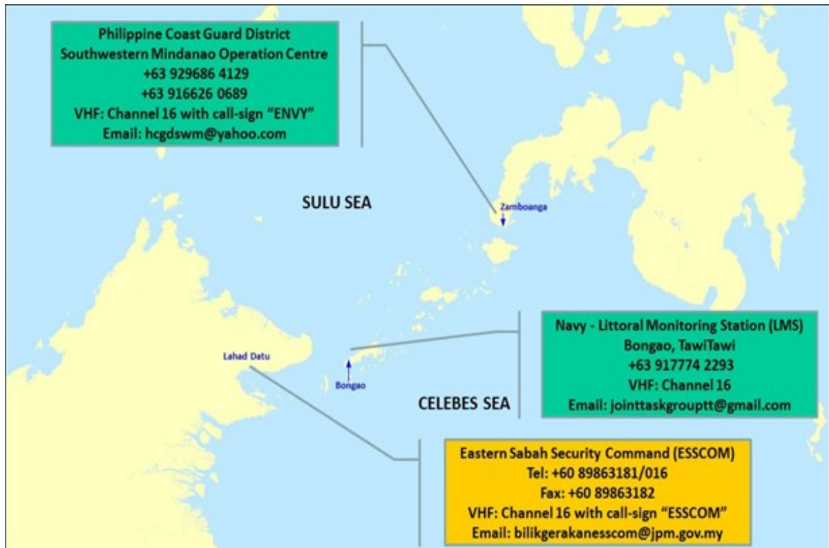
Contact details of the reporting centres

The ReCAAP ISC reiterates its advisory issued via the ReCAAP ISC Incident Alert dated 21 November 2016 to all ships to exercise extra vigilance when transiting the Sulu-Celebes Sea and off eastern Sabah region. All vessels are encouraged to report to the following Philippine authorities and ESSCOM prior to entering or passing the Sibutu Passage and Sulu-Celebes Sea: