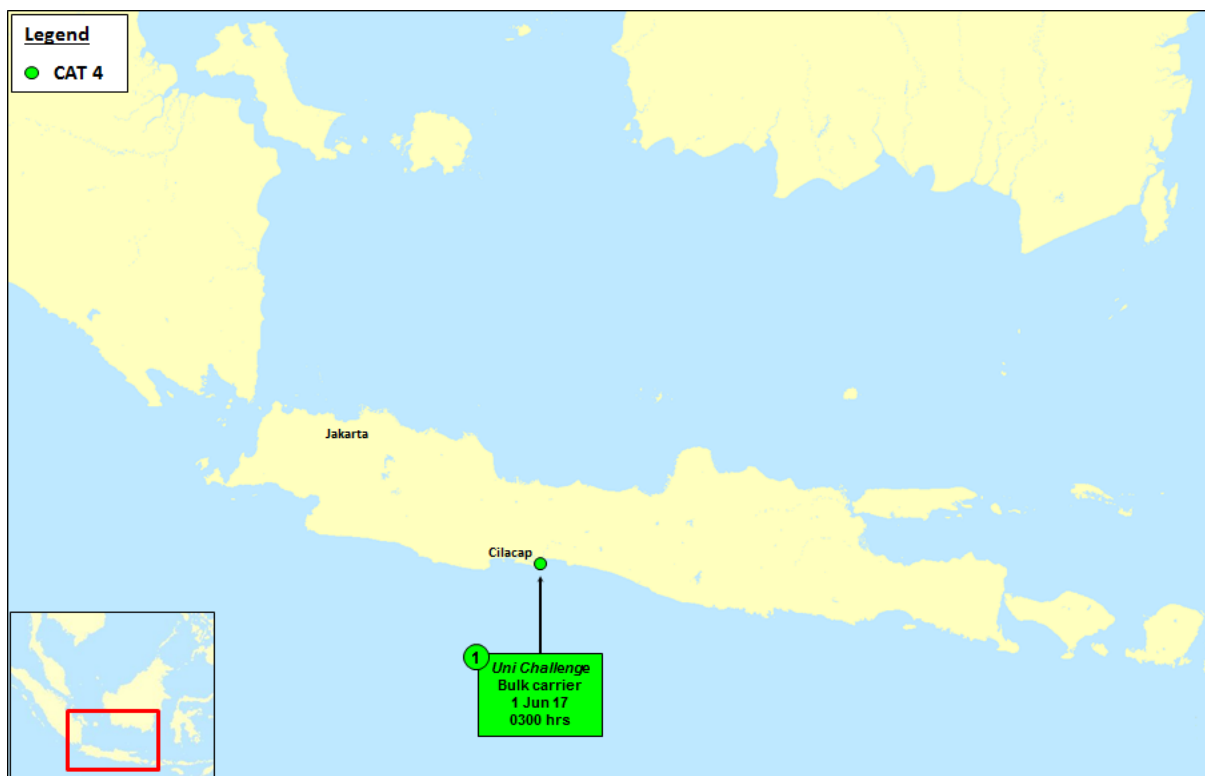
Location of incident

During 30 May - 5 June 17, one incident of armed robbery against ships in Asia was reported to the ReCAAP ISC. The location of the incident is shown in map below; and detailed description tabulated in attachment.