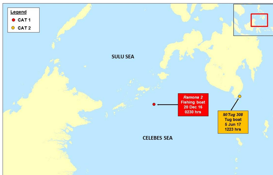
Location of incidents

The Focal Point also reported to the ReCAAP ISC the escape of one of the abducted crew of fishing boat Ramona 2 on 6 Jun 17 (after being held in captivity for more than five months). Fishing boat Ramona 2 was boarded on 20 Dec 16 by an unknown number of perpetrators who abducted its four crew. One of the crew was beheaded by the abductors on 13 Apr 17 in Sitio Pantay Minol, Brgy. Tanum, Patikul, Sulu. To date, the remaining two crew of Ramona 2 are still being held in captivity. The updates on this incident were reported in previous ReCAAP ISC Weekly Reports covering the period 20-26 Dec 16 and 18-24 Apr 17.