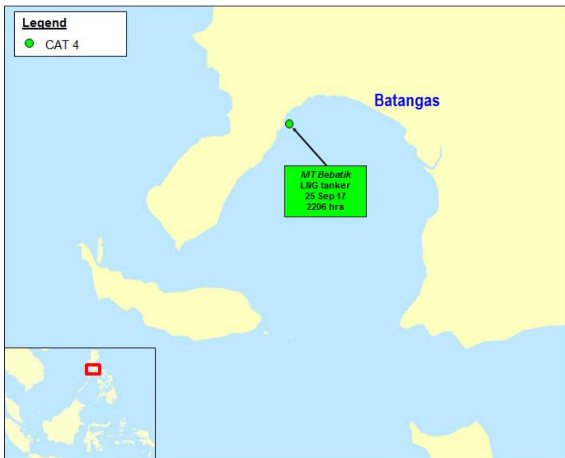
Location of incident

For the period of 26 Sep-2 Oct 17, one incident of armed robbery against ship was reported to the ReCAAP ISC. The location of the incident is shown in the map below; and detailed description tabulated in attachment.