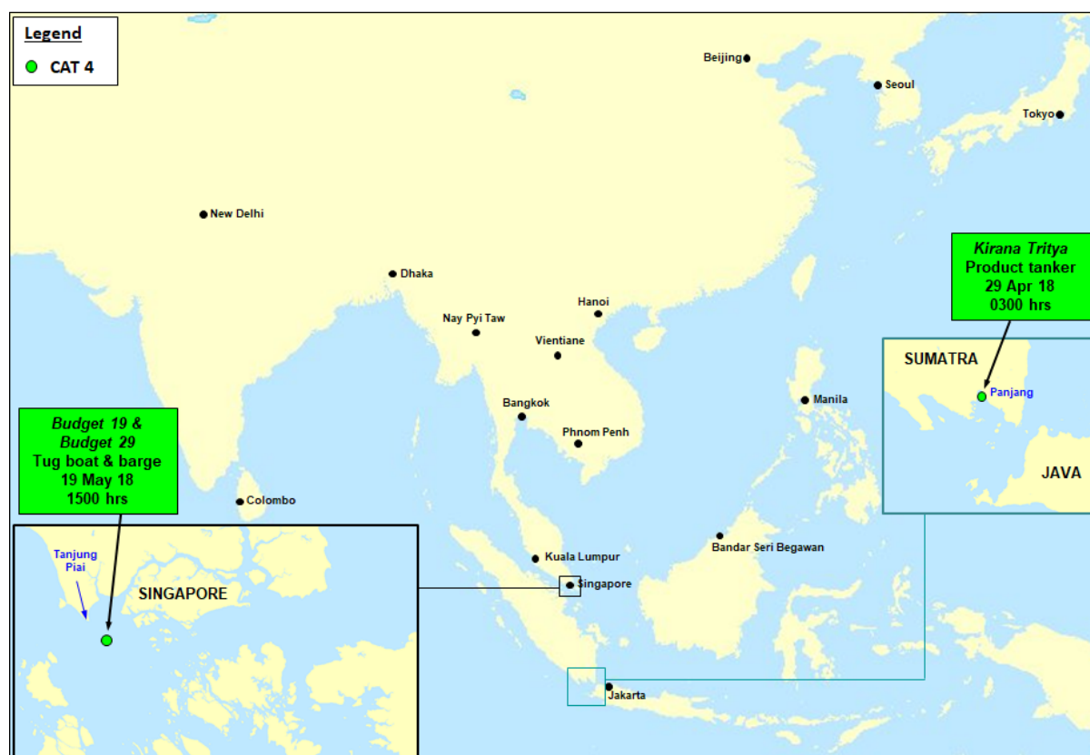
Locations of incident

During the period of 15-21 May 18, two incidents of armed robbery against ships were reported to the ReCAAP ISC. The location of the incidents is shown in the map below; and detailed description tabulated in attachment.