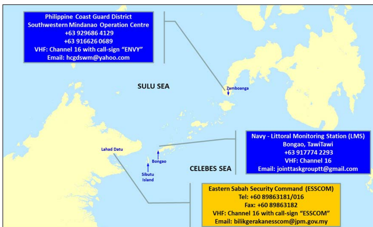
Contact details of the reporting centres

The ReCAAP ISC reiterates its advisory issued via the ReCAAP ISC Incident Alert dated 21 November 2016 to all ships to re-route from the area, where possible. Otherwise, ship masters and crew are strongly urged to exercise extra vigilance while transiting the Sulu-Celebes Seas and eastern Sabah region, and report immediately to the following Centres: