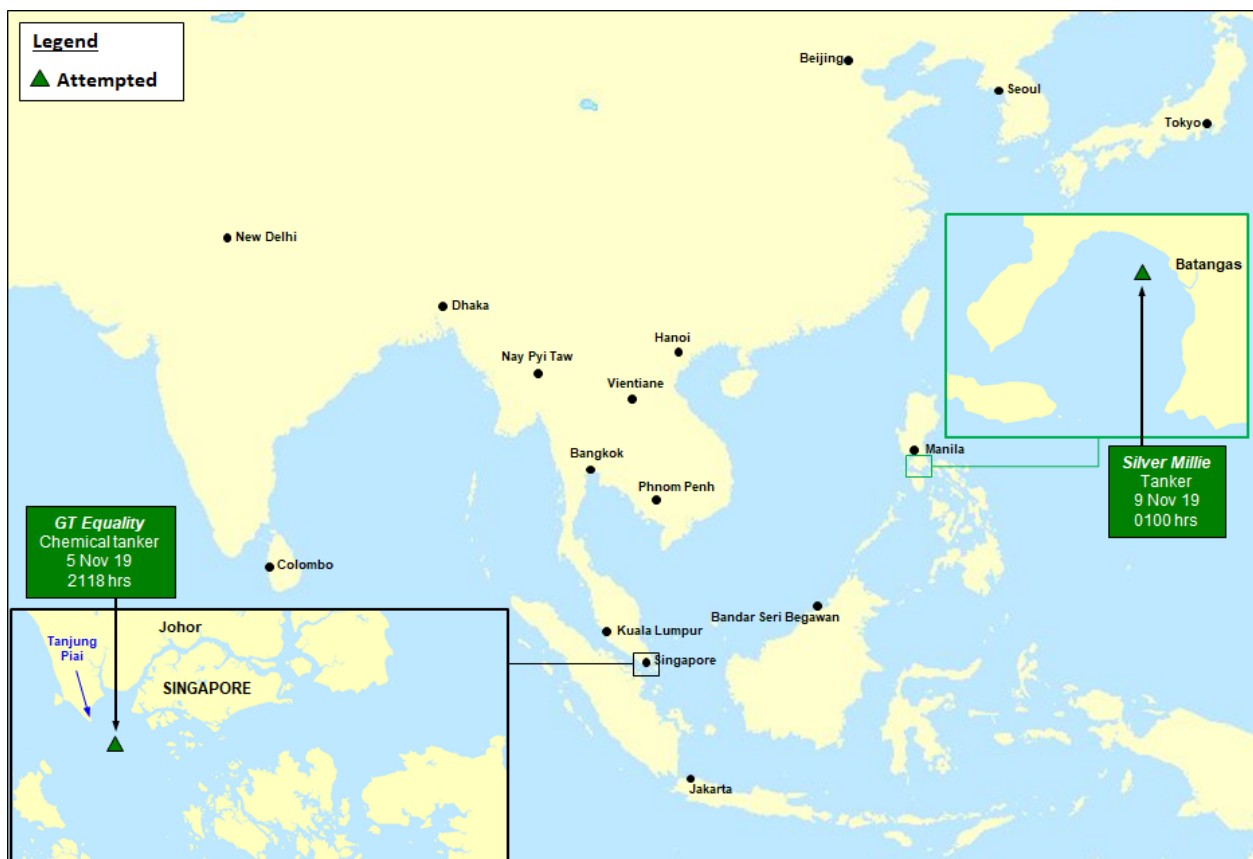
Location of the incidents

During 12-18 Nov 19, two attempted 1 incidents of armed robbery against ships in Asia were reported to ReCAAP ISC by ReCAAP Focal Points. The incidents occurred in the Singapore Strait and at Alpha Anchorage, Batangas Bay, Philippines. The location of the incidents is shown in the map below; and detailed description is tabulated in attachment.