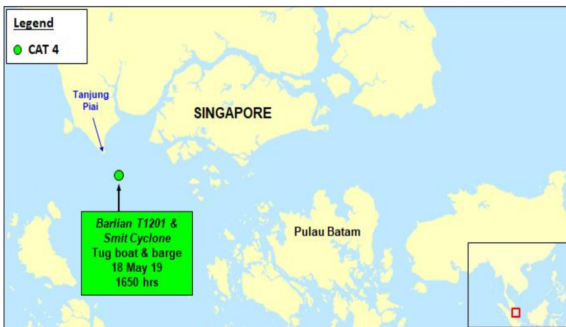
Location of incident

During 14-20 May 19, one Category 4 1 incident of armed robbery against ship in Asia was reported to ReCAAP ISC. The incident occurred on 18 May 19 at approximately 3.3 nm southeast off Tanjung Piai, Malaysia in the westbound lane of the Traffic Separation Scheme (TSS) of the Singapore Strait. This incident is in the vicinity of the previous four incidents reported in the Singapore Strait from February to April 2019. The location of the incident is shown in map below; and detailed description tabulated in attachment.