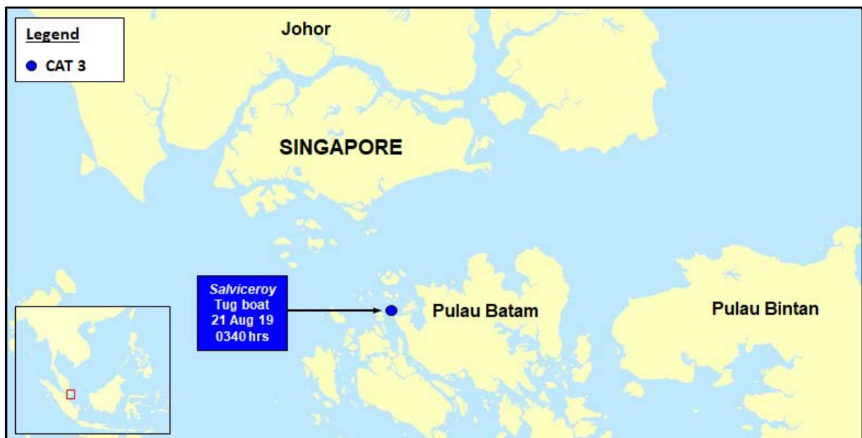
Location of the Incident

Refer to map below for the location of the incident. The detailed description of the incident is tabulated in the attachment.