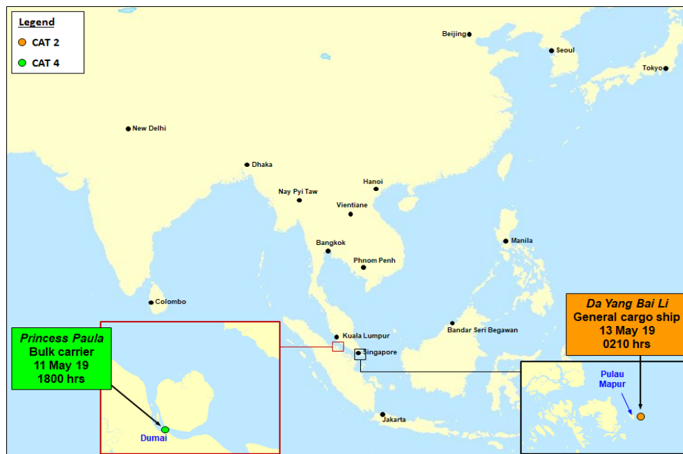
Location of incidents

During 21-27 May 19, one Category 2 1 incident and one Category 4 2 incident of armed robbery against ships in Asia were reported to ReCAAP ISC. This is the first Category 2 incident reported in 2019 which involved the crew being held hostage by perpetrators armed with knives; and cash and personal effects of the crew were stolen. Both incidents occurred in Indonesia. Category 2 incident occurred approximately 4 nm east of Pulau Mapur on 13 May 19 and Category 4 incident occurred at Lubuk Gaung anchorage in Dumai on 11 May 19. The location of the incidents is shown in the map below; and detailed descriptions are tabulated in attachment.