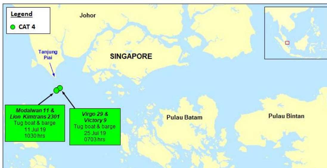
Location of the Incidents

During 23 – 29 Jul 19, two CAT 4 1 incidents of armed robbery against ship were reported to the ReCAAP ISC. Both incidents occurred to tug boats towing barges while underway in the westbound lane of the Traffic Separation Scheme (TSS) in the Singapore Strait. The incidents occurred on 11 Jul 19 and 25 Jul 19 in the western sector of the Singapore Strait. The location of the incidents is shown in the map below, and description tabulated in the attachment.