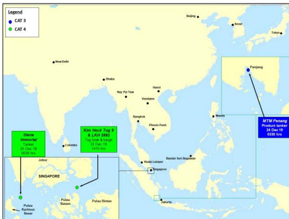
Location of the incidents

During 24-30 Dec 19, three actual incidents of armed robbery against ships in Asia were reported to ReCAAP ISC. One was a CAT 3 1 incident and two were CAT 4 2 incidents. The CAT 3 incident occurred to a ship while anchored at Panjang Customary Anchorage, Lampung, Sumatra, Indonesia. The two CAT 4 incidents occurred to ships while underway in the eastbound lane of the Traffic Separation Scheme (TSS) in the Singapore Strait. The location of the incidents is shown in the map below; and detailed description tabulated in the attachment.