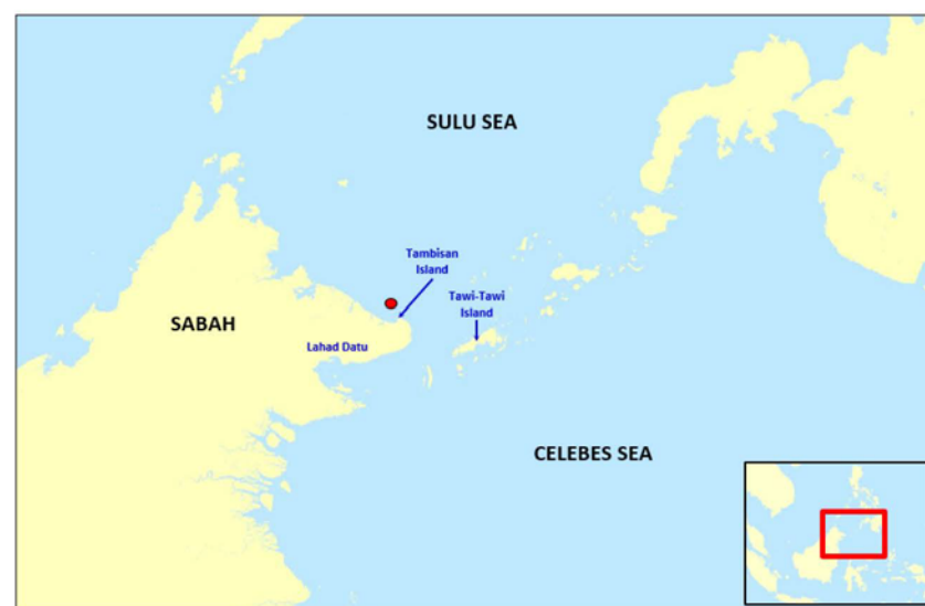
Location of the incident

The Philippine Coast Guard District Southwestern Mindanao has intensified their seaborne and coastal security patrol in coordination with Philippine and Malaysian authorities.