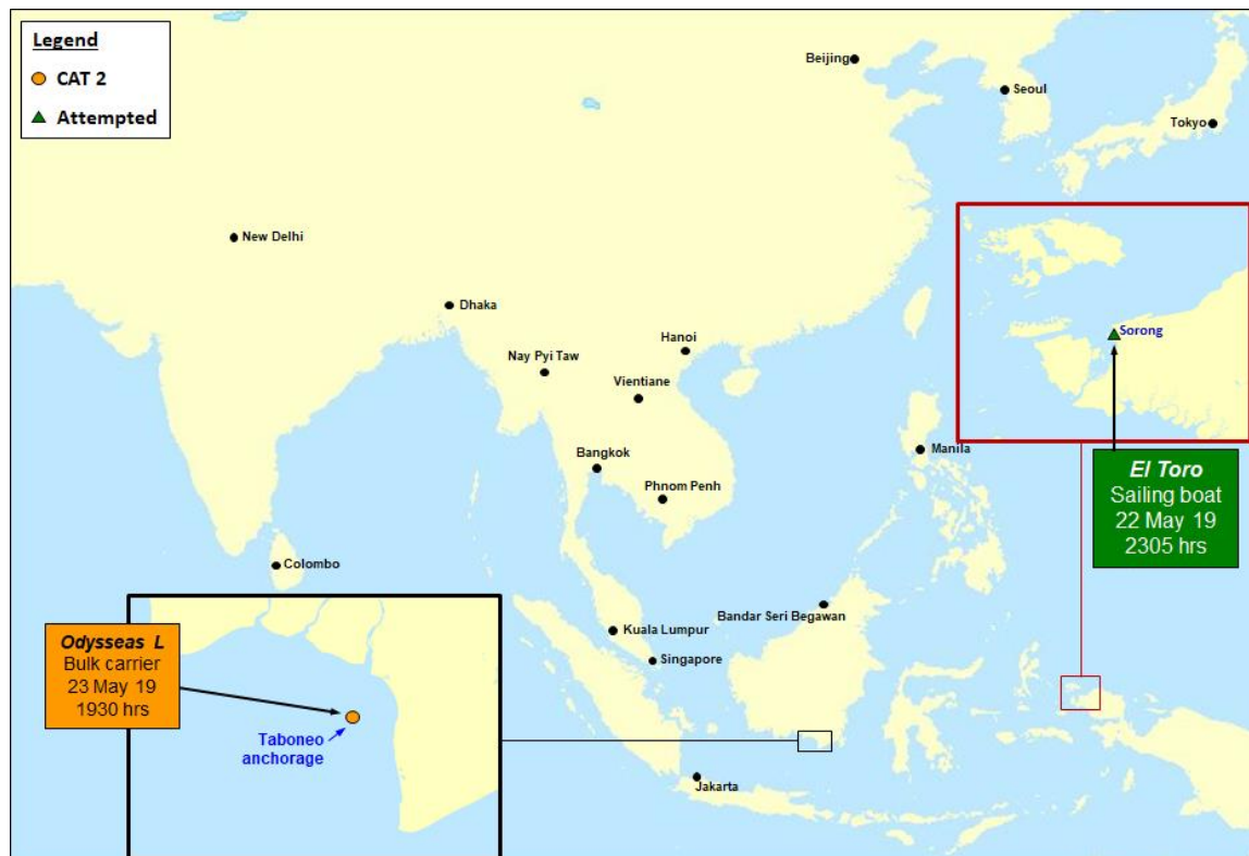
Location of the incidents

During 25 Jun -1 Jul 19, one Category 2 1 incident and one attempted incident of armed robbery against ships in Asia were reported to ReCAAP ISC. The Category 2 incident occurred at Taboneo Anchorage, Kalimantan, Indonesia on 23 May 19 when perpetrators armed with knives boarded a bulk carrier, confronted the crew, stole ship stores and escaped. The attempted incident occurred off Pulau Doom, Sorong, Indonesia on 22 May 19 whereby a perpetrator tried to steal the dinghy of a sailing boat. The locations of the incidents are shown below, and description tabulated in the attachment.