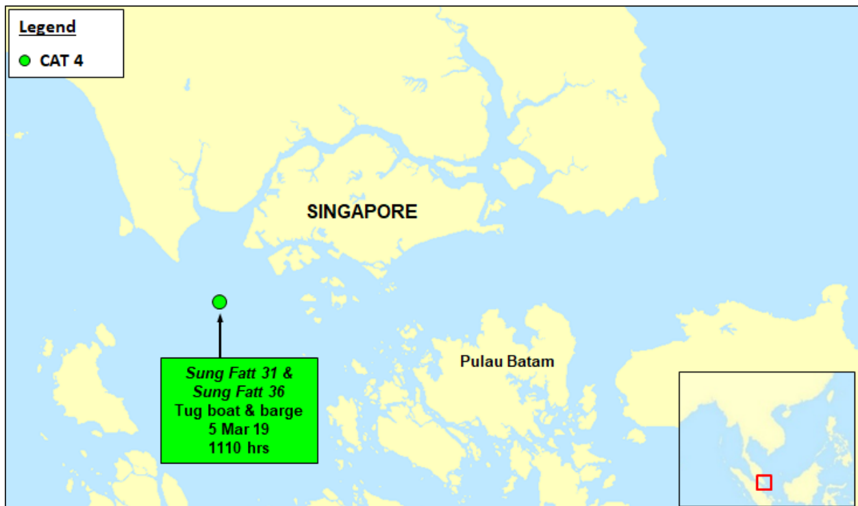
Location of incident

During 26 Feb- 4 Mar 19, an incident of armed robbery against ship was reported to ReCAAP ISC. The location of the incident is shown in the map below; and detailed description of the incident is tabulated in attachment.