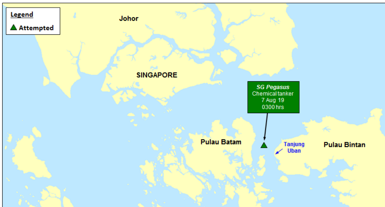
Approximate location of incident

During 3-9 Sep 19, one attempted incident of armed robbery against ship was reported to the ReCAAP ISC. The incident occurred to a tanker while anchored at Tanjung Uban anchorage, Pulau Bintan, Indonesia on 7 Aug 19. Refer to map below for the location of the incident. The detailed description of the incident is tabulated in the attachment.