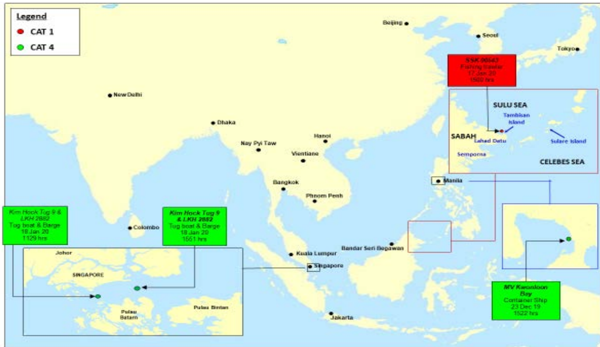
Location of the incidents