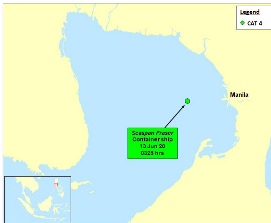
Location of incident

The location of the incident is shown in the map below; and detailed description of the incident tabulated in the attachment.