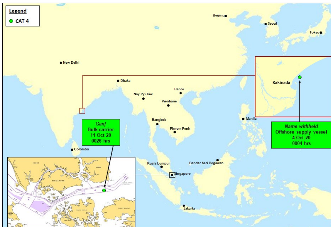
Location of incidents

The location of the incidents is shown in the map below; and detailed description of the incidents tabulated in the attachment.