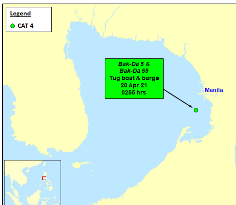
Location of incident

The location of the incident is shown in the map and detailed description of the incident tabulated in the attachment.