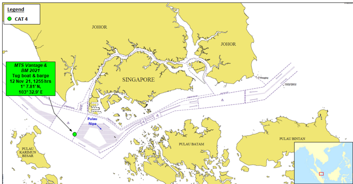
Location of incident